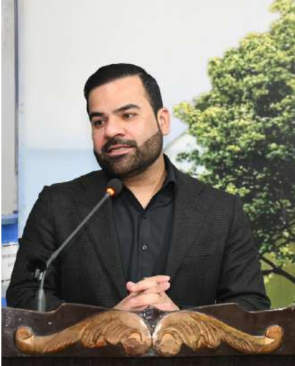
Minister of State Barrister Aqeel Malik