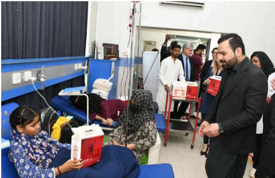
Lunch box being given by Minister of State Barrister Aqeel Malik