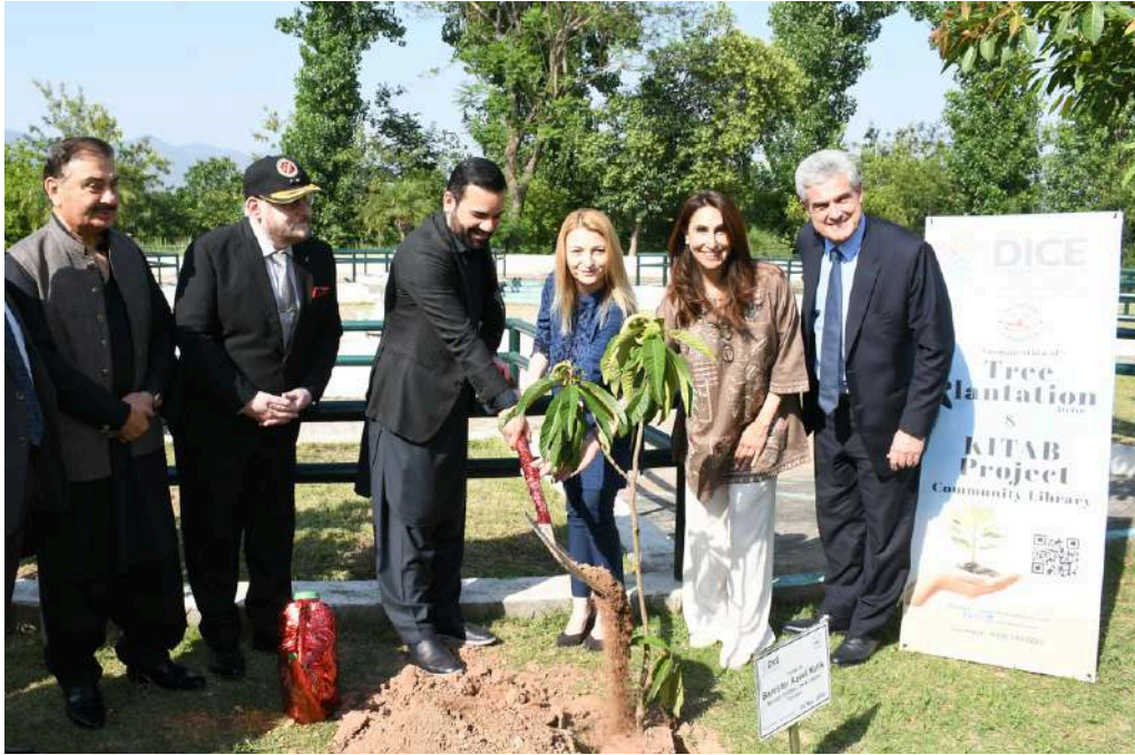
Tree Plantation by Minister of State Barrister Aqeel Malik and Ambassador of Bulgaria